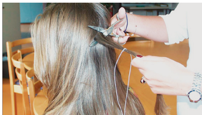
Hair sampling: the first important step in hair testing