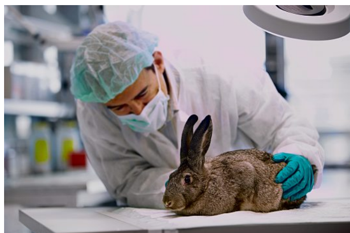
Novartis adheres to the principles of the 3Rs, implemented in a variety of areas, including the environment, nutrition, health status of the animals, procedural training, education and, finally, animal experimentation.

As an example of education and training at Novartis, she mentions the rabbit silicone ear invented by a Novartis animal caretaker. This is a patented training device for taking blood and carrying out intravenous injections in rabbit ear veins and arteries. In this way it replaces the need to use live animals in initial basic exercises for trainees in animal experimental techniques.