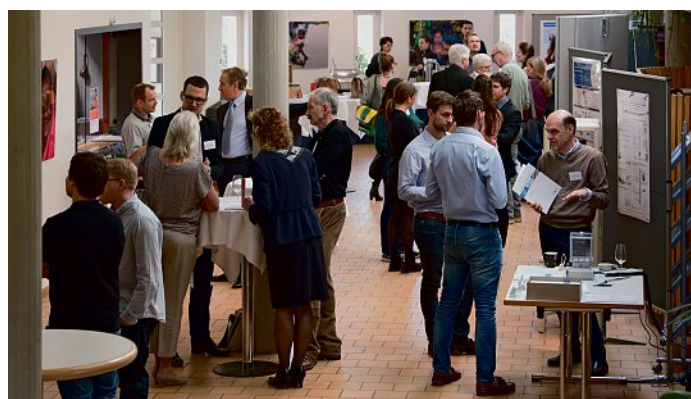
TEDD and Animalfree Research discuss the challenges of serum-free cell culture on the occasion of the TEDD & 3R Workshop organized at the ZHAW Waedenswil on 7 April 2017.

One promising avenue towards animal-free research is the use of sophisticated in vitro cell and tissue models using human cells. The use of animal products is still widespread in cell cultivation, namely Fetal Calf Serum (FCS). FCS or FBS (Fetal Bovine Serum) – as it is also called today – is the blood fraction remaining after the coagulation of blood, followed by centrifugation to remove any remaining red blood cells. Today it is an essential admixture to animal and human cell culture media as it has a very low level of antibodies and contains growth factors, allowing for versatility in different cell culture applications. But Dr. Gerhard Gstraunthaler , from the Division of Physiology at Medical University of Innsbruck, lists a series of disadvantages.