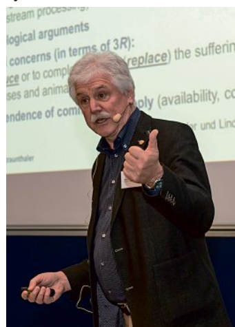
Professor Gerhard Gstraunthaler from the University of Innsbruck is critical as to the widespread use today of Fetal Bovine Serum and presents options as alternatives to FBS.

The search for strategies to reduce or replace FBS in cell culture is experiencing a boom. The recently developed activated human donor platelets (human platelet lysates, hPL) appear very promising. “The rationale behind the use of hPL is the clotting process itself, which includes the activation of platelets and the exocytic release of \alpha -granule factors”, explains the researcher. “Platelet \alpha -granules contain an array of growth factors required for wound healing and tissue regeneration, but they have also been identified as being essential for cell attachment, growth and proliferation in vitro .” The conditions look good: “hPL are obtained from expired human donor platelets, a recognized, ethically approved, safe and clinically tested, high-quality product. With hPL, bulk platelet growth factors are added to basal culture media, providing a human-based, xeno-free culture system.”