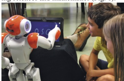
Fig. 1. Digital tools in vocational education and training.

Between 5–8 September 2018, EPFL will host the SCIENTIÆ & ROBOTICA, a congress co-organized by several societies of teachers (SV!A, VSMP, VSN, VSG) as well as SATW, EPFL, NCCR Robotics, CRC, Formation Continue UNIL/EPFL and the Swiss Chemical Society. This is a unique and exciting opportunity to bring together about 200 teachers of science and mathematics at the secondary level II from the whole of Switzerland who will explore the, sometimes unexpected, possibilities of robotics as a tool for teaching sciences and mathematics (Fig. 1).