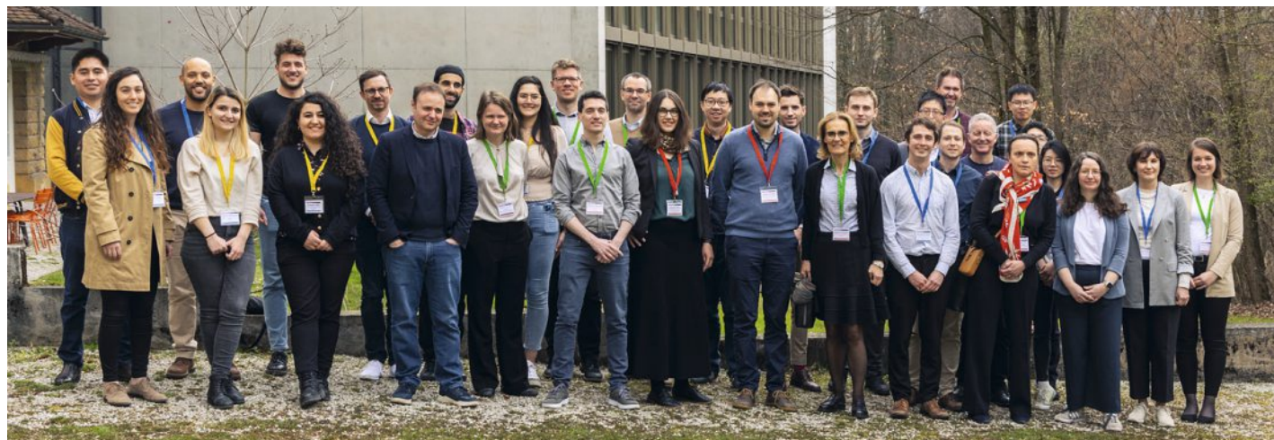
Fig. 3. Photograph of the participants of the DynaMiC conference in Fribourg on March 22–24, 2023 (Credit: Scott Capper, Adolphe Merkle Institute, Switzerland).