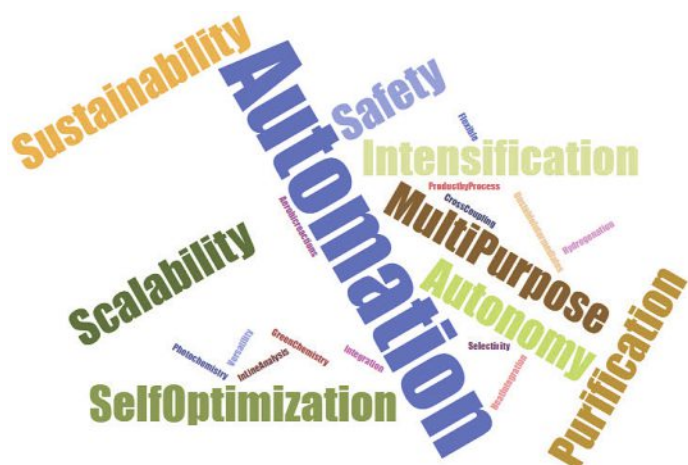
Fig. 5. New input was collected in 2022, indicating increased interest for automation and autonomous experimentation among network members.