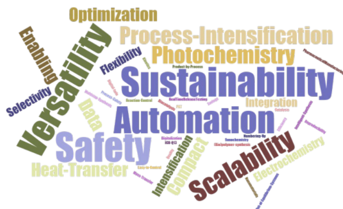
Fig. 4. Word cloud created from members' input in 2021 showcases broad interests of the Flow Chemistry Network. Versatile topics were associated with flow technology, reflecting heterogeneity of the network.

As new scientific breakthroughs are happening every day, so the interests of our network also develop. Comparison of the word clouds generated in 2021 (Fig. 4) and 2022 (Fig. 5) depicts growing interest in automated and autonomous experimentation among the Network's members. To meet this need, we are collaborating with the Artificial Intelligence Network of the SCS to organize a joint Symposium 'Towards the closed Loop' at the ILMAC 2022 in Lausanne.