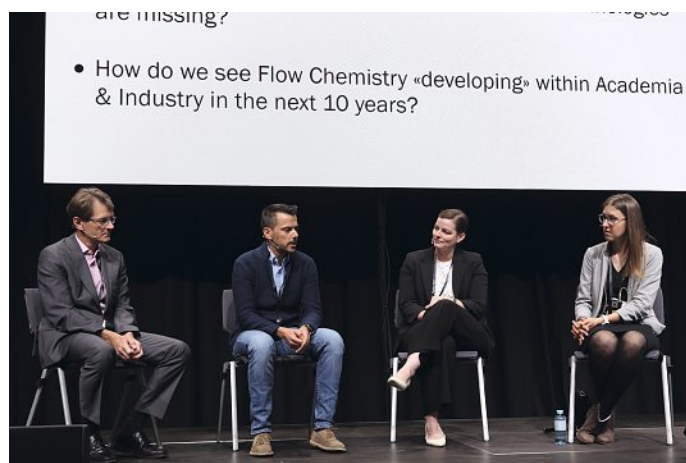
Fig. 1. Panel discussion at the Flow Chemistry Symposium, ILMAC 2021.

We have created a nice curriculum program thanks to the efforts of Prof. Nina Hartrampf, with some guest lectures coming from the core team members (Fig. 2).