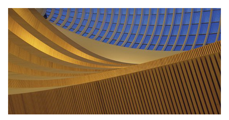
Law library, University of Zurich, designed by Santiago Calatrava.