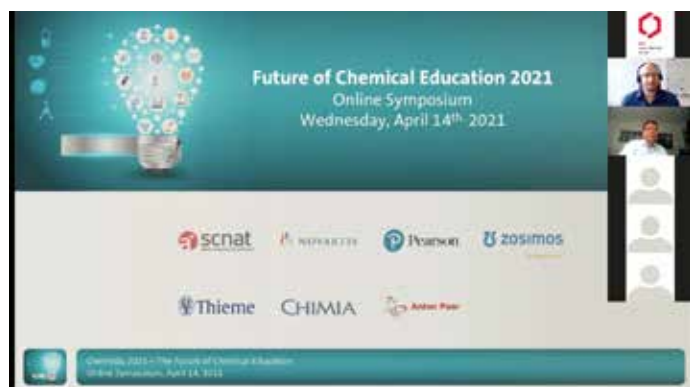
A screenshot of the 'Future of Chemical Education' event 2021, organized as an online Zoom conference.

The leitmotif of the symposium focused on problems and challenges related to teaching chemistry for a large and typically very heterogeneous body of students in the first year at the universities. The event was originally scheduled to take place in August 2020 in Muttens, but for obvious reasons it was rescheduled to April 2021. Although, to our dismay, traditional personal encounters were still not possible, the online symposium turned out to be a motivating and stimulating event. Speakers primarily described their strategies, how they deal with a task that is already quite difficult and demanding, yet their abilities were challenged even more in the last year. The sudden change in the teaching process forced the lecturers to find alternative solutions – solutions, which were maybe foreseen for the future but had to be applied almost immediately. Certainly, a further optimization is still necessary in many cases, but obviously this challenging situation prompted all of us to modify our teaching methods – something we probably wouldn't have done under normal circumstances. There is hardly anyone who does not look forward to a return to the traditional way of teaching, but the experience gathered during the current difficult situation should have a positive effect on our lectures in the future.