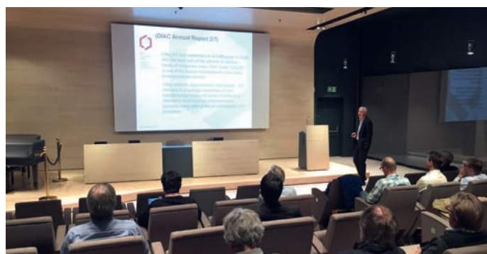
Fig. 3. DIAC's annual meeting held at Metalor Technologies SA in Marine Epagnier in 2019.

Sharing best practice and knowledge in the symposia lectures across the network will keep the interest high, (Fig. 3). This guarantees the sustainable existence of our industrial chemistry in Europe and thus of Switzerland and finally the DIAC.