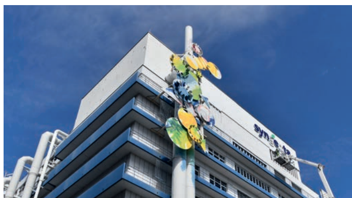
Fig. 2. The logo has changed but the assets remain the same. A good example of sustaining assets.

be preserved. The owner's logo has changed from Novartis to Syngenta, but the assets and people have remained (Fig. 2)