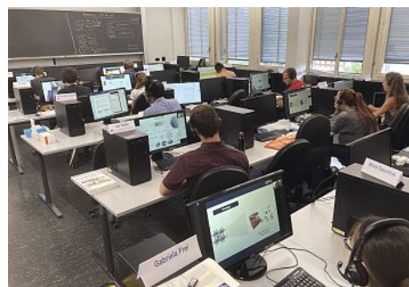
Fig. 2. A look into the Fall Meeting Control Center at the Computer Lab of the Department of Chemistry and Biochemistry of the University of Bern.

For the event, we acquired ten licenses for channels from Zoom, one with up to 1'000, and nine with 300 participants maximally. At the Department of Chemistry and Biochemistry of the University of Bern the ‘Control Center’ (Fig. 2) was installed, which controlled and supervised the online activities.