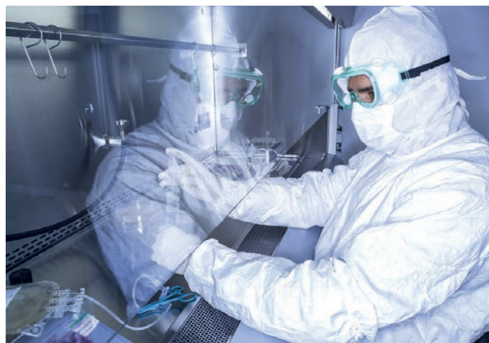
Cell and gene therapy cell processing at the manufacturing site.

Leukapheresis material is collected and cryopreserved at the clinical site and then sent to the manufacturing facility where the enrichment and activation is taking place, making use of CD3/CD28 antibody-coated beads before T cell transduction with a lentiviral vector for genetic reprogramming. T cell expansion is the next step before bead removal, formulation and cryopreservation. Then, the cells are shipped back to the clinical site and the administration is taking place. In the patient, the antigen-binding domain recognizes CD19 on B cells. The CD3-zeta signaling domain initiates T cell activation and mediates antitumor activity.