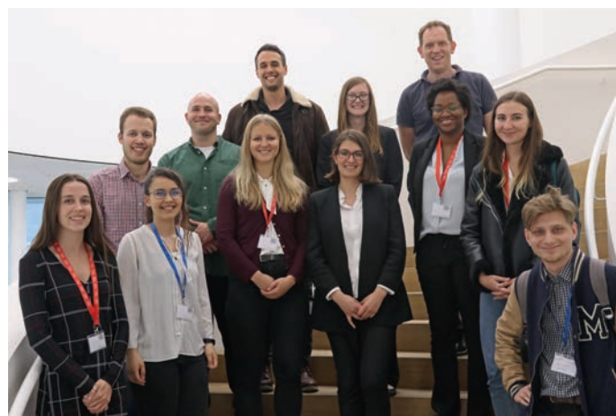
Host and visitors