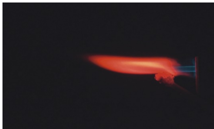
Fig. 1. Typical red flame of a strontium salt observed with a torch for crème brûlée; the tip of the moistened wooden stick carrying the salt is visible near the mouth of the flame.

Working with open flames is obviously a safety issue. Before launching the contest, we tested several simple flame sources available in every household and found that instead of a laboratory Bunsen burner it is also possible and much safer to use a conventional alcohol fondue stove or a small torch for crème brûlée to observe a nice colored flame (see Fig. 1).