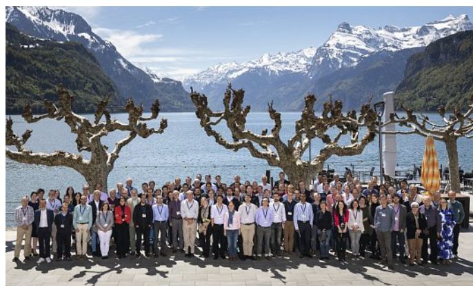
The attendees of the 54 th Bürgenstock conference.