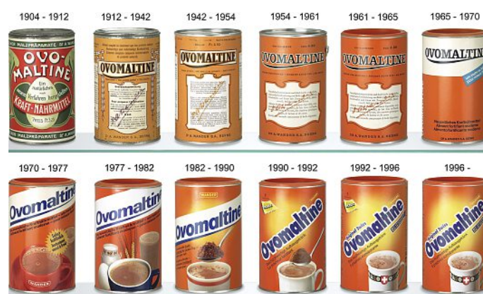
Ovomaltine in its typical orange cans through the years.

Before and after this merger, Ovomaltine had its own success story. In 1904 it was launched as a medical or dietetic preparation and only in 1922 free sale as a general food item was accepted. The image changed rapidly and Ovaltine became and still is one of the most popular sports drinks. Today, Ovomaltine in various forms is the leading product of Wander Ltd., a subsidiary of Associated British Foods, with headquarter and production site in Neueneegg near Bern.