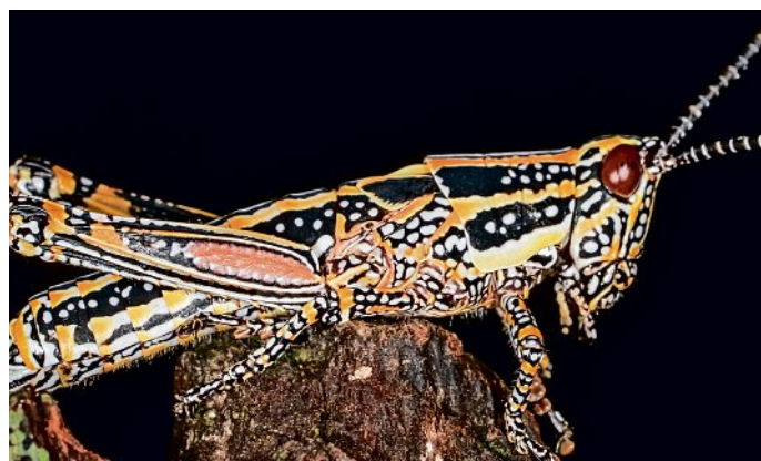
Fig. 2. Juvenile elegant grasshopper ( Z. elegans ).

In pyrrolizidine alkaloids [2,3] (Fig. 3), the nitrogen-heterocycle is bicyclic as exemplified by the alkaloids heliotrine and senecionine (Fig. 3), both of which are ingested by Z. elegans . It is not by accident that Z. elegans encounters plants containing these alkaloids. These insects can detect toxins up to several metres away. One study describes Z. elegans as ‘eagerly’ trying to reach host plants,