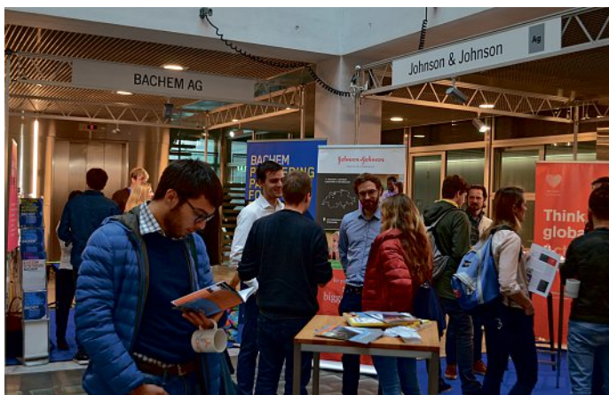
Chemtogether 2017: Over 500 people, mainly students, visited the fair.