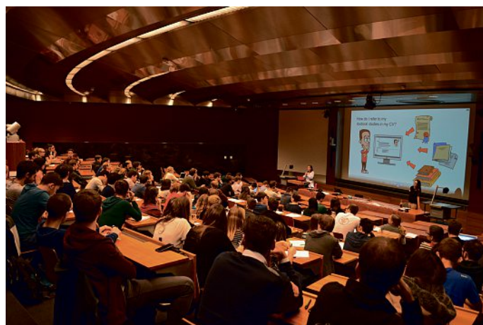
ETH Career Center CV Training: How to write a successful CV.