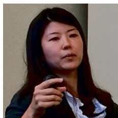
Prof. Kaori Sugihara

For a treatment of Spinal Muscular Atrophy (SMA), a rare genetic disease, Nettekoven gave an insight into Roche's pharmaceutical research. Testing millions of small molecular substances for biological activity can easily be achieved through high throughput screening. But optimizing other properties of an active molecule, such as solubility, lipophilicity or even toxicity, while retaining, or even better, increasing its biological activity is a challenge that only knowledgeable scientists can achieve. A drug development project of this magnitude requires a huge workforce. By investing in such projects, Roche gathers insights and knowledge that might be transferable to other challenging projects in the future.