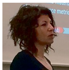
Prof. Raffaella Buonsanti

strate in the hydrophobic enzymatic pocket (cyclase). Structural preorganization and stabilization of the cationic intermediates within the enzymatic pocket enable the controlled formation of different products ( e.g. eucalyptol, limonene, \alpha -terpinene) from a single substrate ( e.g. geranyl pyrophosphate) under mild (pH = 6–7) conditions and with high selectivity. In contrast, this type of reaction is difficult to control using the conventional methods of chemistry. Tiefenbacher's group uses a self-assembled resorcinarene-based molecular capsule as an artificial enzyme mimic. The reaction is initiated by an external acid and takes place inside the cavity of the capsule where the aromatic moieties enable stabilization of the intermediate carbocations via cation- \pi and cation-dipole interactions. This strategy gave striking results with monoterpenes. For instance, the capsule catalysed the transformation of geranyl acetate into \alpha -terpinene, and that of nerol into eucalyptol with yields in the order of 35%. The same capsule was used for other chemical transformations, and enhances enantioselectivity in iminium-catalysed 1,4-reduction of \alpha,\beta -unsaturated aldehydes. In this case, the capsule binds the iminium species via cation- \pi interactions, providing a steric shielding which favours the reaction on the less hindered side, and improves enantiomeric excess by up to 65% as compared to the experiment without capsule.