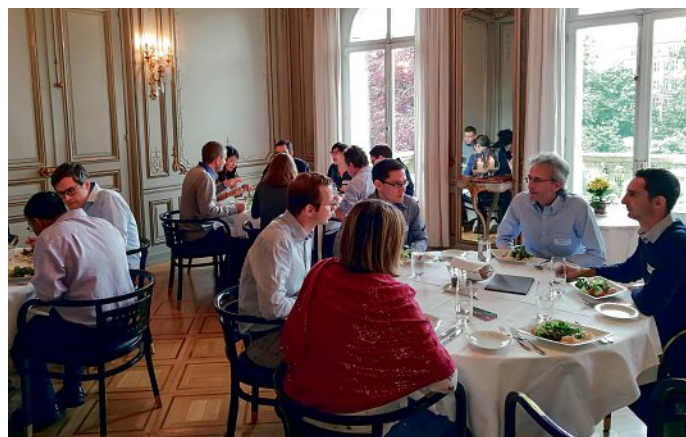
Discussions continued through the lunch break.

of pathologies such as cardiomyopathy, diabetes and inflammations. Prof. Pablo Rivera-Fuentes (ETH Zürich) described his interest on the topic and reported the design of photoactivable luminescent phosphine probes to investigate the effects of reductive stress in biological processes. A series of probes was synthesised upon derivatization of suitable fluorescent dyes with a trialkylphosphine, which causes a strong quenching of their fluorescence. The photoactivable derivatives are uptaken by HeLa cells where, upon irradiation with UV light, they release the trialkylphosphine that consequently induces reductive stress. Concomitant release of the dye triggers fluorescence, allowing for a visual mapping of the process. In their work, the group demonstrated that the released phosphine is capable of reducing the oxidized form of glutathione, thus perturbing the redox homeostasis of the cellular environment. The induced reductive stress promotes protein aggregation. The group is currently working on improving the spatial resolution of their technique and expanding its scope, notably by targeting cell organelles.