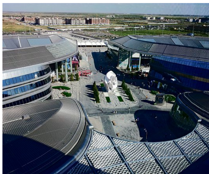
View from the central globe towards buildings hosting countries pavilions.

Eurasian National University (ENU) took part in a workshop on microbial fuel cells, despite it being held during the vacation period. The expert first gave a brief introduction to MFC – a future source of energy that converts wastewater, food waste and other organic substances into bioelectricity and generates purified water at the same time. He spoke about laboratory work done at HES-SO in Sion, where stacked microbial fuel cells are currently under investigation. A 12-litre MFC was recently constructed. This reactor has been operated under various parameters to yield information on how to prevent and resolve voltage reversals, on charging lithium batteries, and on its potential for simultaneously purifying wastewater (see Bioresource Technology 2017, 238, 519–527). Work is also being conducted with real wastewater on a pilot scale in collaboration with several wastewater treatment plants in Switzerland.