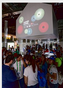
Inside the Swiss Pavilion at Astana EXPO 2017. Photo Présence Suisse est l'unité du Département fédéral des affaires étrangères.