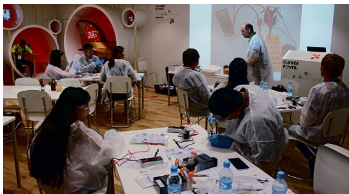
The participants during the Microbial fuel cell workshop exploring this future source of energy transforming waste water, food waste and other organic material into bioelectricity.