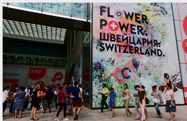
In front of the Swiss Pavilion attracting visitors with the motto flower power. Photo Présence Suisse est l'unité du Département fédéral des affaires étrangères.

http://houseofswitzerland.org/events/expo-astana-2017