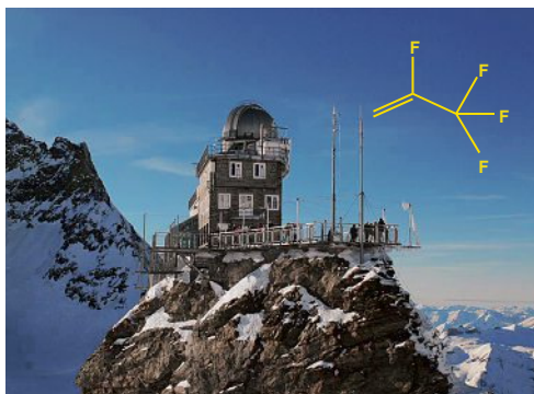
High-altitude research station Jungfraujoch, Switzerland.

An example is the highly-debated replacement of HFC-134a