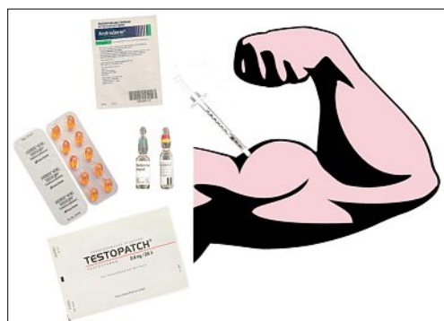
Testosterone doping and its anabolic action.

To overcome well-known weaknesses of this 'urinary steroid profile', such as genetic polymorphism (lack of enzyme responsible for testosterone glucuronidation), the monitoring of biosynthetic and metabolic pathways of testosterone in blood matrix could constitute a complementary approach. In this research, pills and patches of testosterone have therefore been administered to healthy volunteers and, after serum sample collection, selected endogenous blood steroid levels were monitored by LC-MS(/MS) with the aim of highlighting relevant biomarkers of exogenous testosterone abuse in the blood matrix. By applying multivariate data analysis, testosterone and especially dihydrotestosterone concentrations in serum were highlighted as significantly influenced by testosterone administration. Monitoring these two hormone levels in a longitudinal manner demonstrated that intra-individual reference values were clearly exceeded following testosterone administration compared to negative control (same person in the absence of administration).