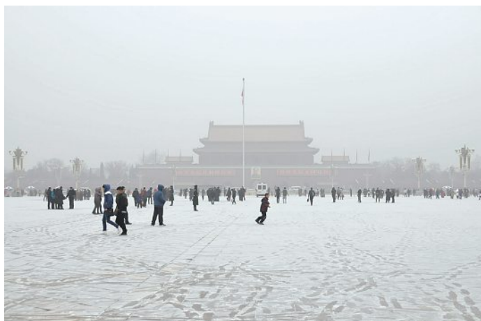
Beijing (here at Tiananmen Square) is one of the Chinese cities with severe air quality problems during haze events in winter.

During severe pollution episodes in January 2013, aerosols were collected on quartz filters in four major cities of China, i.e. Beijing, Xi'an, Shanghai and Guangzhou. Here, we show results from Beijing as one example. For a unique chemical analysis, several chromatographic and mass spectrometric techniques were combined. The two most important methods were a newly developed offline application of aerosol mass spectrometry, which identifies major aerosol components and their general emission processes, and measurement of the radioactive carbon isotope ^{14}\text{C} (radiocarbon) with accelerator mass spectrometry, which allows the distinction of emissions from fossil sources