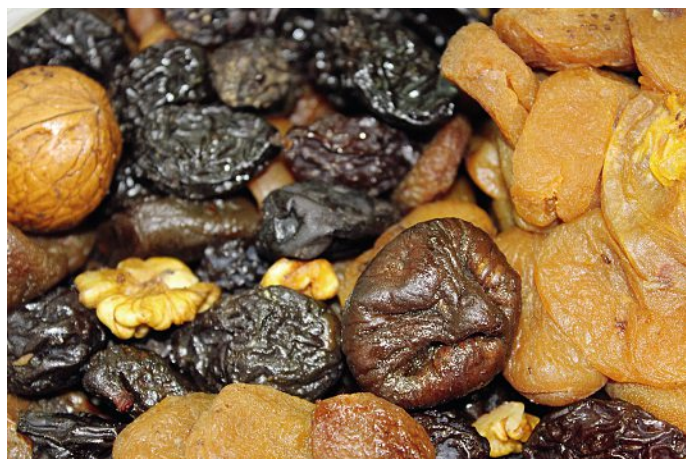
As the researchers found in their study, dried prunes, apricots, figs and walnuts – past their expiry date – serve as an excellent carbon-rich waste co-substrate for anaerobic digestion.

Developing renewable energy, especially energy from biomass, is a central aim of the EC’s energy policy. The Irish project managers from the DAITHI O’MURCHU Marine Research Station Ltd. think that ORION will have an impact on energy use since the system offers cost-effective and reliable