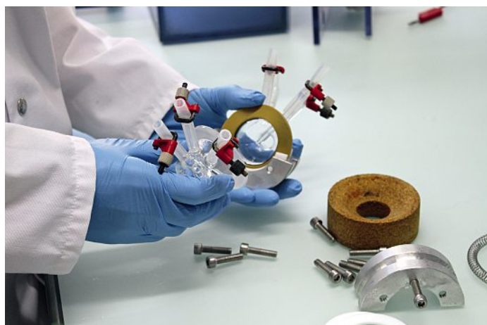
The microbial fuel cell made of glass serves in this project for experiments under sterile conditions.