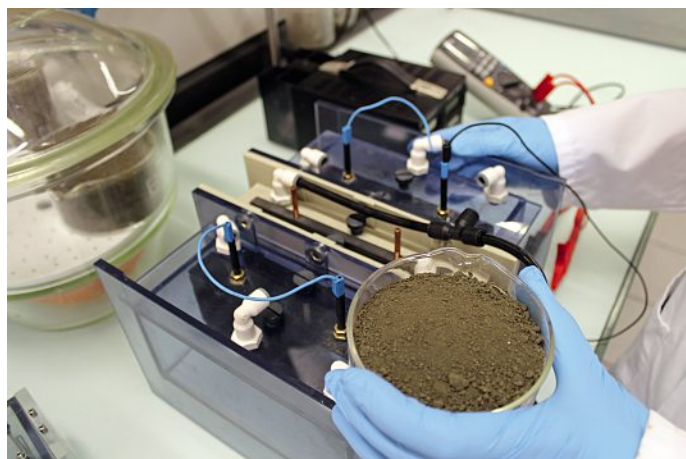
Marc Sugnaux shows de-watered and digested sewage sludge prior to phosphate extraction in the microbial fuel cell. In the middle of the reactor, the abiotic cathode for phosphate remobilization, to the left, the bio-anode in the wastewater stream for the production of bio electricity.

An important influence is exerted by the predominant pH level. This level allows a fast substitution mechanism and is particularly virulent under electrolysis conditions. Apart from the strong pH dependence, the researchers observed a temperature effect, with an acceleration of the process at a slightly elevated temperature. Fabian Fischer's group analysed the produced struvite fertilizer by inductively coupled plasma mass spectrometry (ICP-MS). The investigation confirmed that the levels of cadmium, lead and other heavy metals in recycled fertilizer could easily be kept below the legal limits.