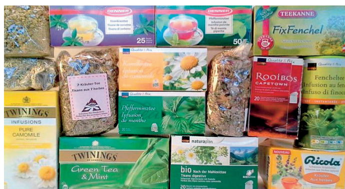
Samples of selected teas and herbal teas from the Swiss market.