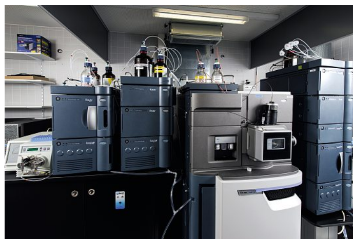
With the UPLC Xevo TQ-S researchers at the Inselspital Bern quantify known metabolites with a validated method. On the other hand, non-targeted metabolomics has the purpose to identify unknown metabolites. In this case, the scientists undertake a wide screening with the UPLC Synapt G2-S HDMS System in order to detect the maximum number of metabolites.