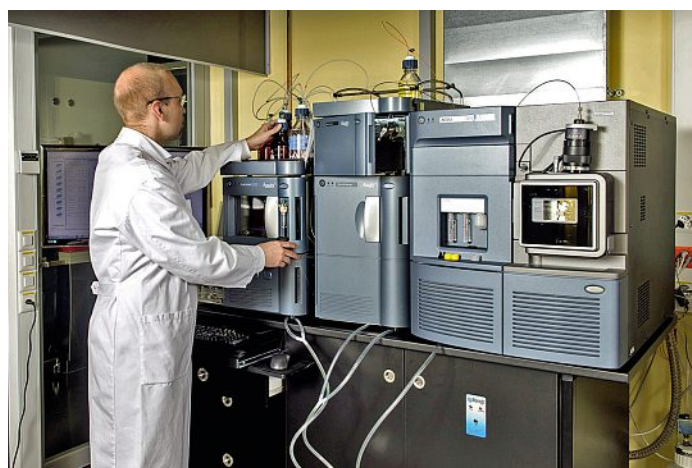
Acquity UPLC separation system coupled with a Xevo TQ-S (Waters) mass spectrometer at the Inselspital Bern. The UPLC separates metabolites, then the mass spectrometer ionises the molecules for the analysis.