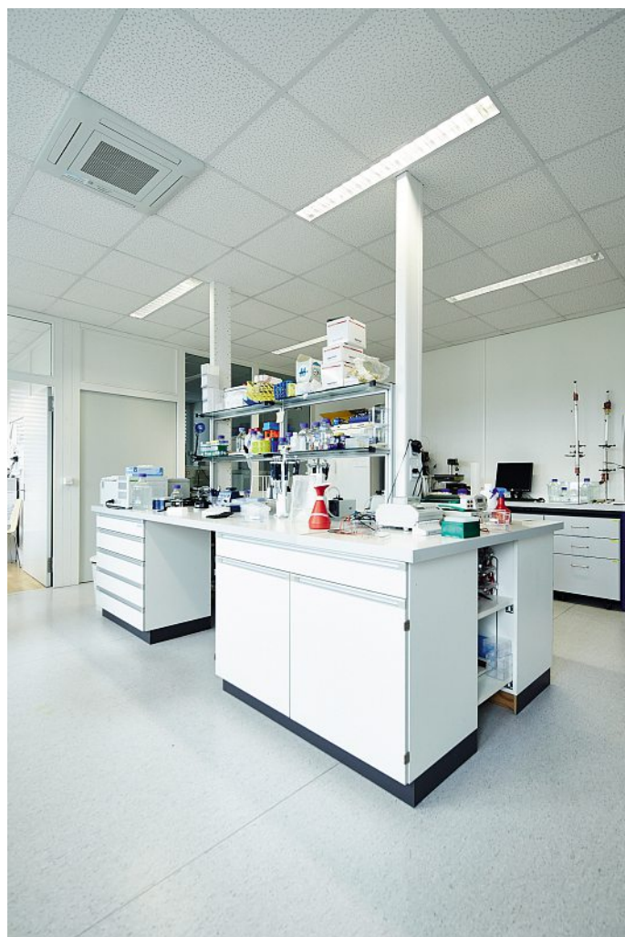
The diagnostic tools developed by ProteoMediX laboratories to enable personalized medicine will reduce overtreatment by providing urgently needed diagnostic tests that support physicians in their therapy decision making.

capable of diagnosing prostate cancer with significantly higher accuracy than the current clinical standard. In 2010 they founded the spin-off company ProteoMediX (CHIMIA 2012, 66, 1-2, 61). The stakes are considerable, as – according to the NIH – prostate cancer is of increasing significance worldwide. In many industrialized nations such as the United States, it is one of the most common cancers and among the leading causes of cancer deaths. But three out of four current diagnoses are wrong and lead to unnecessary biopsies. Inadequate prognostic methods cause overtreatment, as two thirds of the prostate tumours do not need immediate treatment. Treatment procedures are unspecific, which explains why oncology drugs have no effect in up to 75% of patients. The resulting costs are enormous, as one single biopsy costs about US $ 1500, while overtreatment costs are estimated at US $ 7700 per patient in the US. Therefore, ProteoMediX wants to drive innovation forward in diagnosing the disease more accurately.