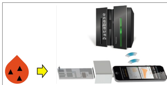
Design model of the future POC instrument for TDM. A drop of blood is processed in a disposable sample preparation cartridge. Analyte molecules – depicted as triangles – are then quantified in the analytical module before results are sent to a remote database. (Illustration C. Guiducci, EPFL, adapted by M. Pfeifer)

One limitation of how therapeutic drug monitoring is done today is the fact that processing and analysis of samples usually have to take place in centralized laboratories of larger hospitals. Patients have to travel to these hospitals to give blood or have to visit their family doctors who will then ship samples to be analysed with automated high-throughput instruments. Logistically this is inconvenient for the patient and associated with costs, and it means that the test results are obtained with a certain delay before therapy may have to be adjusted. Thus, a fairly complex and expensive overall workflow as well as the need to collect millilitre amounts of blood prohibits implementation of more frequent measurements to support early determination of development of inappropriate plasma concentration profiles. A reliable point-of-care (POC) device capable of measuring drug levels in a drop of blood at the family doctor’s office or even at the patient’s home would offer new possibilities for managing critical values and timely drug dosage adjustments. Studies with anticoagulation self-management, for instance, have actually shown that incidence and complications (thrombosis, major bleeding) can be reduced with such POC devices for home use testing.