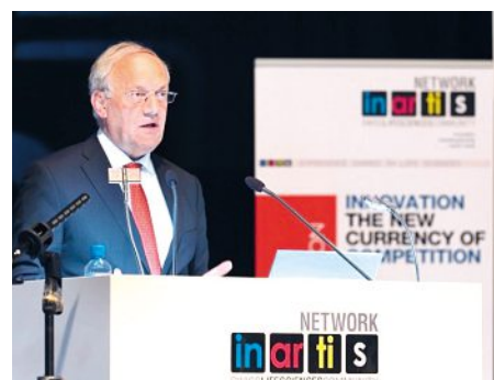
Fig. 2. Federal Council Johann N. Schneider-Ammann at the kick-off event of INARTIS NETWORK at EPFL on 28 March 2013.