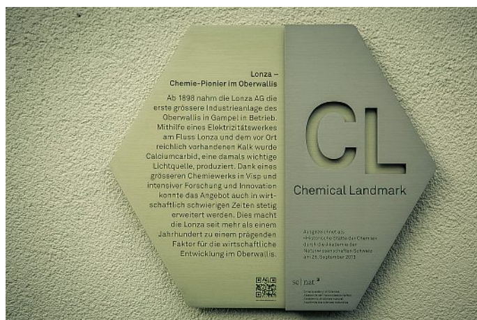
The Commemorative plate

This sets an interesting scene for the new EPFL Campus in Sion and will hopefully create a dynamic platform for sustainable chemistry and chemical engineering with strong connections with industry. The commemorative plate was then unveiled and affixed at the entrance of the site on Lonzastrasse , where everyone can easily visit it.