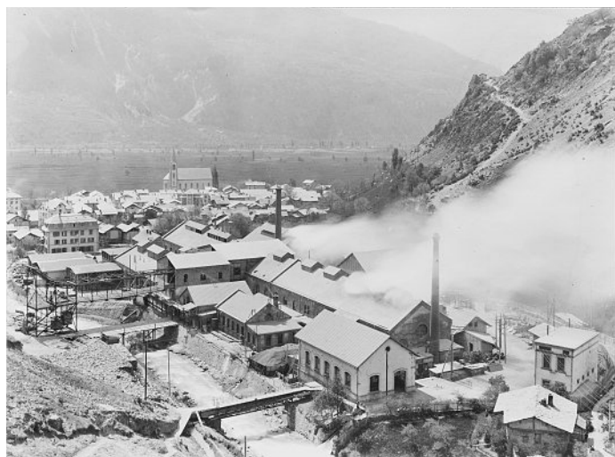
The first site of Lonza in Gampel was built in 1897

The fifth «Chemical Landmark» in Switzerland was awarded to the upper Valais which has been one of the cradles of Swiss chemistry for over a century. The site of Lonza in Visp is among the oldest and more important industrial areas for chemistry in Switzerland.