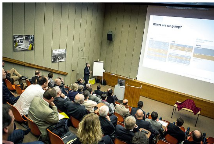
Impressions of the ceremony