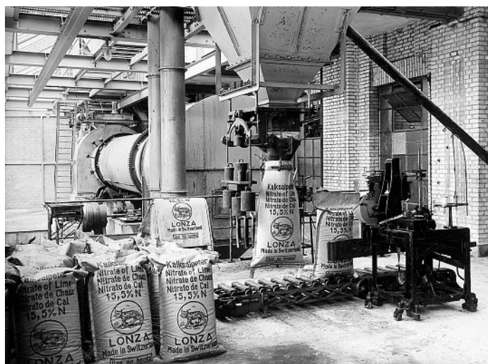
The manufacture of calcium nitrate (fertilizer)

The first important industrial site was put in service by Lonza in Gampel starting from 1897. The presence of a hydroelectric power plant by the river Lonza and the natural abundance of lime made the production of calcium carbide possible, which