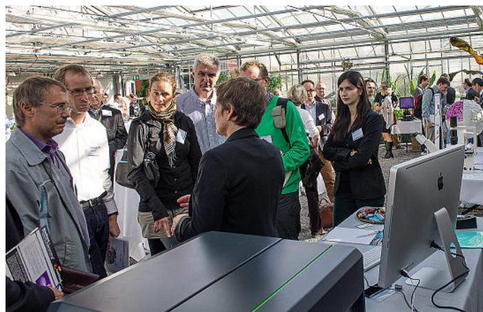
Impression from the TEDD Annual Meeting 2013: Visitors enjoy the opportunity to exchange ideas and network in the greenhouse of the ZHAW campus.