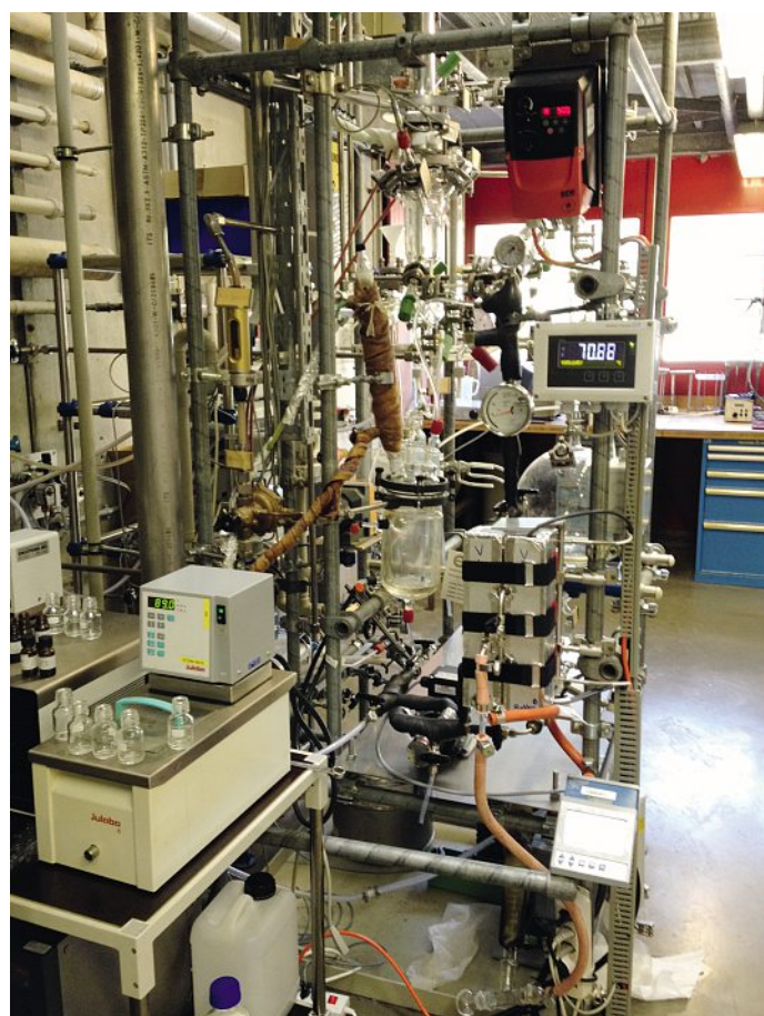
Fig. 1. Hybrid process (rectification and pervaporation unit).

Due to the expected longer lifetime and better thermal stability, ceramic membranes were tested with priority and compared to polymer membranes. In many test runs with different parameters like temperature and flow rate, the membranes were characterized regarding their water flux and solvent purity obtained, measured