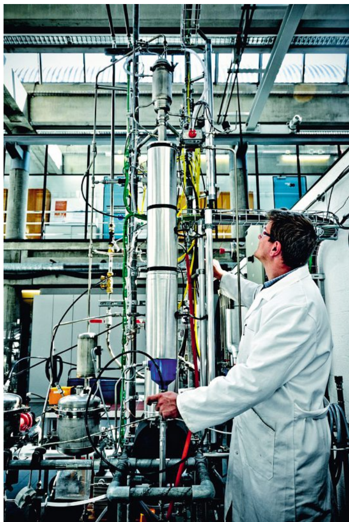
Fig. 3. Distillation unit heated by solar thermal energy.

prevented commercialization. [11] Conventional LSCs consist of a plastic sheet – typically poly(methyl methacrylate) – containing strongly fluorescent organic dyes. Alternative architectures are based on dye/polymer thin films on waveguides. [12] Incident sunlight is absorbed by the fluorescent dye molecules and the subsequently emitted light is partially trapped in the waveguide by total internal reflection. Coupling of LSCs to small edge-mounted solar cells leads to low-cost light-weight photovoltaic devices that work equally well in direct and diffuse light. However, the inevitable overlap between the absorption and emission spectra of the fluorescent dyes leads to strong self-absorption and ultimately to insufficient device performance. [12]