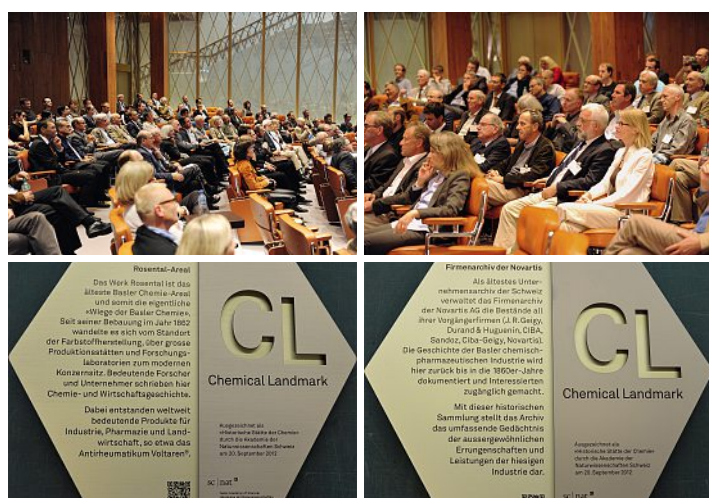
Impressions of the ceremony – The Commemorative plaques (left: Rosental; right: Novartis Company Archive).

Additional documents on the «Chemical Landmark 2012» and further information about the Chemical Landmarks program are available using the link: www.chemicallandmarks.ch/2012 or the QR-code below.