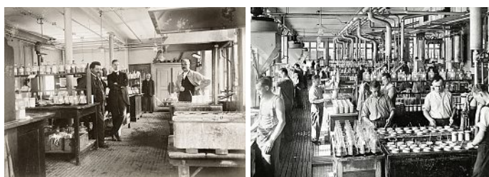
The old laboratory (left) and production facility (right).