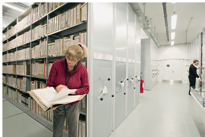
Company archive of Novartis AG.

Novartis AG holds the oldest company archive in Switzerland, which includes the records of all its predecessor companies going back to the 1860s. Namely, these companies are the following: J. R. Geigy AG (founded 1758), Durand & Huguenin AG (founded 1872), Ciba Ltd. (founded 1884), Sandoz AG (founded 1886), Wander AG (from 1967), Ciba-Geigy AG (merger 1970), and Novartis AG (fusion 1996).