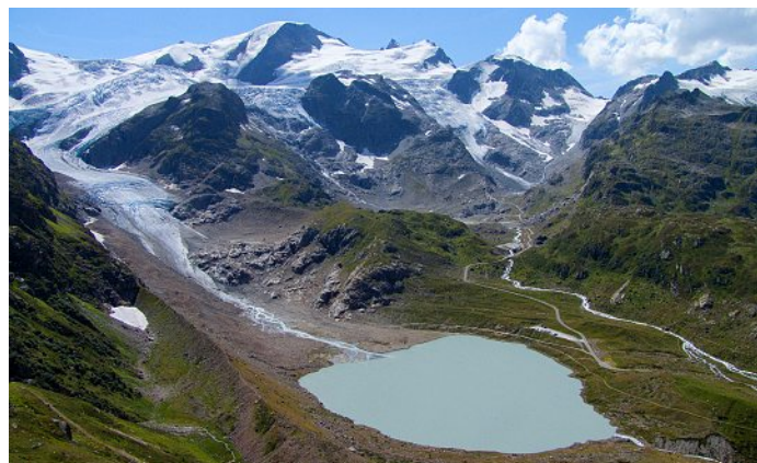
Stein glacier and Lake Stein in the Bernese Alps.

Industrial chemicals such as polychlorinated biphenyls (PCB) and dichlorodiphenyltrichloroethane (DDT) have been produced and used in large quantities more than 50 years ago. During the phase of application they were released to the environment and mainly distributed by atmospheric transport. Today, due to their hazardous properties these chemicals are apostrophized as persistent organic pollutants (POPs) and are banned worldwide by the Stockholm Convention. However, they are still circulating in the environment. Actual and historical atmospheric input of chemicals can be calculated from investigations of dated lake sediments. Trace analyses of POPs in sediments from Swiss plateau lakes using gas chromatography-high resolution mass spectrometry show decreasing input in the last 40 years. In strong contrast, we observed increasing input in proglacial lakes. This surprising phenomenon led us to the ‘glacier hypothesis’ claiming that POPs deposited in the past on glaciers are now released from the melting ice. This hypothesis has been corroborated by findings from sediment analyses of several mountain lakes. In these investigations we observed that not only the long-term behavior of glacier movement and ablation but also short-term based growth and decline are reflected in the sediment input of a proglacial lake.