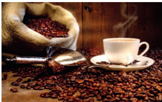
The flavour of roasted coffee.

Keywords: Coffee · On-line process control · Principle Component Analysis (PCA) · Proton-transfer-reaction time-of-flight mass spectrometry (PTR-ToF-MS) · Roasting