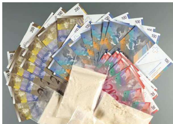
Cocaine seizures on Swiss banknotes.

In the fight against illicit drug trafficking, police investigations cannot solely rely on the seizure of illicit drugs to determine the involvement of people in such activities. More often than not, investigators have to collate information from different sources (testimonies, intelligence database, observations, etc. ) in order to gather intelligence that could serve to reveal the structure of