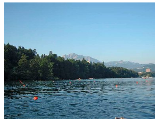
The Rotsee near Lucerne, prepared for a rowing regatta.

Methane pathways in lakes. Depending on the specific situation, inflowing and outflowing water may contain small or larger concentrations of methane. (Artwork: Eliane Scharmin)