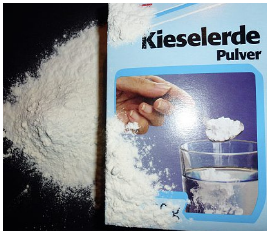
Commercially available healing earth.

Alpha spectrum of a healing earth extract. For quantification control 209 Po was added (70 mBq). 209 Po has an alpha energy of 4'800 keV. The sample was counted for 24 h in an alpha vacuum chamber (silicon barrier detector).