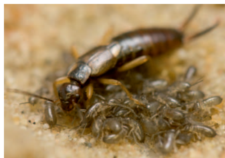
An earwig mother tending her clutch of 1st instar nymphs.

European earwig ( Forficula auricularia ; Dermaptera) mothers care for their nymphs by defending them against predators and providing food via individual mouth to mouth food regurgitation. Chemical extract from CHCs of nymphs reared under different nutritional conditions (high-food versus low-food) were