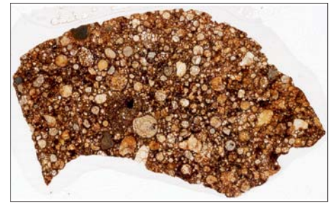
Fig. 1. Thin section of an ordinary chondrite found in the desert of Oman in 2010, showing the characteristic texture of densely packed chondrules. Image width is 37 mm.

Chondrites are the most common class of meteorites (Fig. 1). Their name-giving constituents are the chondrules, spherical bodies typically 0.2 to 1 mm in diameter (Fig. 2). They consist of partially recrystallized Mg,Fe-rich glass and are set in a fine-grained matrix. Chondrites of the Ivunatype (CI) consist only of fine-grained serpentine matrix lacking chondrules. While the matrix of chondrites can be regarded as the most pristine leftover of the solar nebula, chondrules are drops of former silicate melt formed by melting of dust in the solar nebula. A third major constituent of many chondrites types is iron–nickel metal. After assembly to asteroids, chondritic material has undergone various levels of metamorphism ranging from weak recrystallization of glass to complete recrystallization and partial melting.