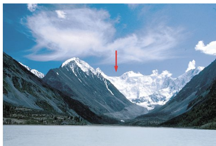
Belukha massif in the Siberian Altai and the Ak-kem lake. The 139 m long ice core was drilled in 2001 in the saddle between west and east summit ( 49^{\circ}48'\text{N} , 86^{\circ}34'\text{E} , 4062 m asl).