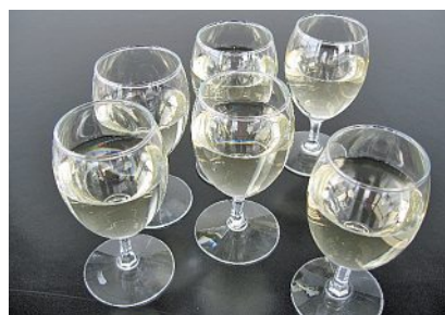
How much is too much?