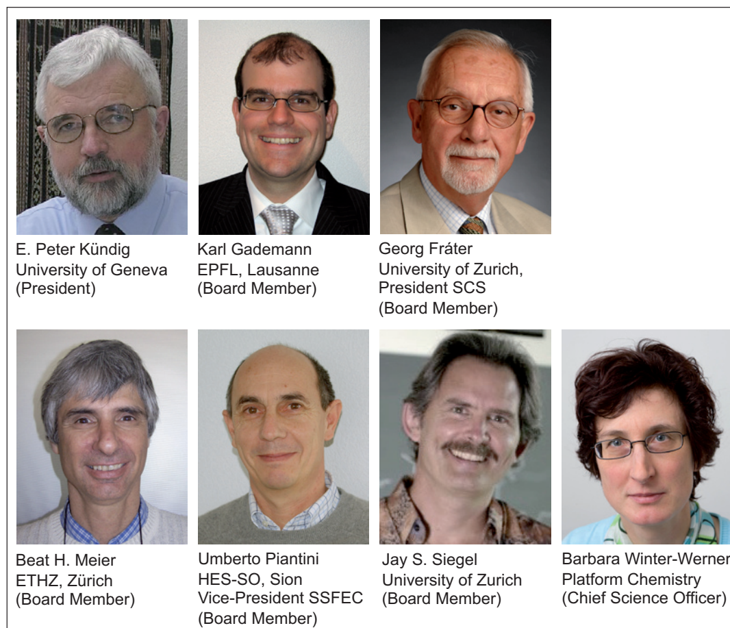
Fig 2. Board of the «Platform Chemistry» (PFC) of SCNAT

Active participation of Ph.D. students at international congresses is an important part of the educational program since it allows students to measure, compare, and discuss their scientific results at an international level. In 2008, the PFC made financial contributions to 19 PhD students to participate at the 2nd EUCHEMS conference (Torino, Sept 2008). For 2009, rather than focus on a single event, the PFC has set up the 'SCNAT Chemistry Travel Award' which is advertised in CHIMIA, [1] and on the PFC website ( www.chemistry.scnat.ch/travel_award ).