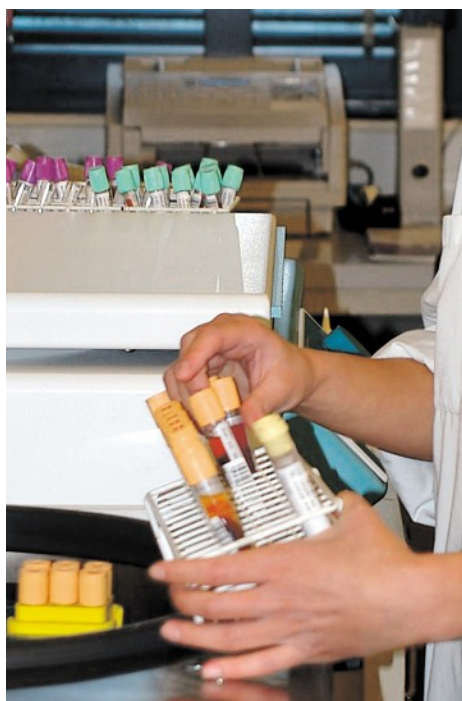
Blood samples being transferred to the centrifuge