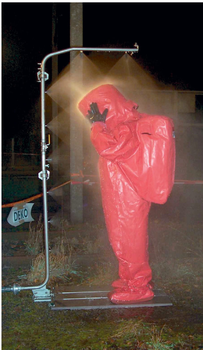
Fig. 2. Decontamination of a HazMat unit member in a protective suit. In most cases water is a suitable decontamination reagent.

Taking suitable precautions to ensure their own safety, fire service personnel remove the casualty from the contaminated zone as