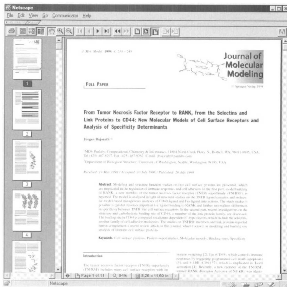
Fig. 1. Layout of a full-paper published in the Journal of Molecular Modeling

The Journal of Molecular Modeling deliberately adopted a conservative for-