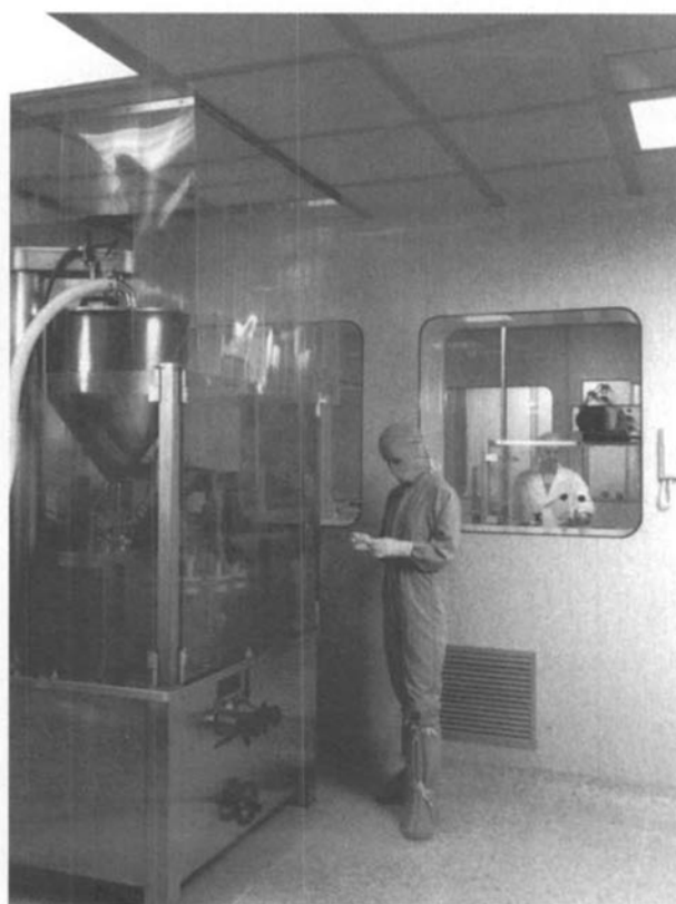
Figure. The production of cream and gel under sterile conditions

IBSA's essential strategy, is the accomplishment of new original specialties, through the modification of known chemical entities, or the production of new pharmaceutical forms protected by international patents. Following this principle,