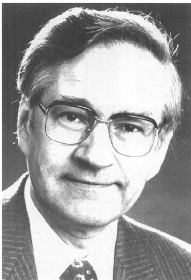
Prof. Richard R. Ernst