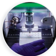
Direct mass analysis from TLC-plates