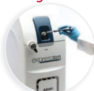
Fast reaction monitoring through analysis in seconds