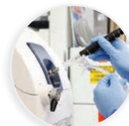
With transfer unit for air-sensitive samples