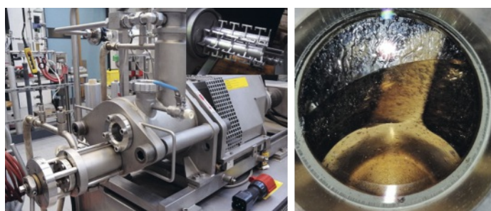
Fig. 1. Scale-up of the melt polycondensation in the kneader reactor.