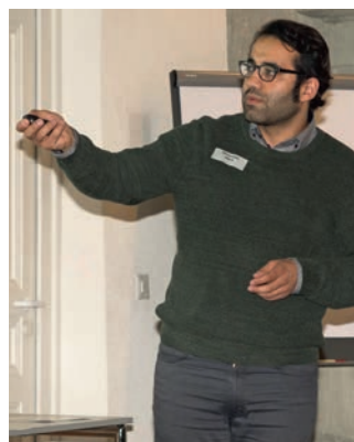
Prof. Michael Saliba

by saying that polymerization can be achieved even with metallic copper and demonstrated such process by catalyzing a radical polymerization with an old British 2 pence coin. ATRP enables to polymerize a wide variety of monomers with different chemical functionalities that would normally be not tolerated in ionic polymerizations, and allows, therefore, to obtain heterostructures or different functional groups in the side-chains of the main polymer chain. Finally, the possibility of introducing automation into the field of radical polymerization was discussed.