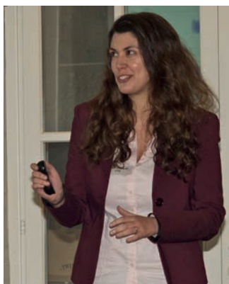
Prof. Athina Anastasaki

science journalist maintaining a popular Instagram account dedicated to science outreach to the public. She focused not only on communicating the results of our scientific work to the world but also highlighted the importance of different channels that can deliver different outcomes useful to our own careers. For instance, Twitter brings visibility that can lead to enhancing the citation rate of our work but it is not the target platform that the younger generation follows. Should a scientist want to attract young students to the lab, Instagram can be a more suitable platform. She then addressed the typical fears that prevent people to join the social networks, such as fear of being wrong, ignored, yelled at, or simply the often unclear institutional rules that persist at universities. She also highlighted a study aimed at challenging the public stereotypes using selfies of scientists at their work. Interestingly, selfies of female scientist are perceived better by the public than those of their male colleagues, despite the generally observed gender inequality in science.