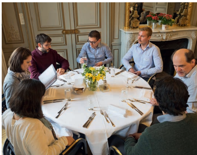
The discussions about the topics of the morning session continued during the lunch break.

science journalist maintaining a popular Instagram account dedicated to science outreach to the public. She focused not only on communicating the results of our scientific work to the world but also highlighted the importance of different channels that can deliver different outcomes useful to our own careers. For instance, Twitter brings visibility that can lead to enhancing the citation rate of our work but it is not the target platform that the younger generation follows. Should a scientist want to attract young students to the lab, Instagram can be a more suitable platform. She then addressed the typical fears that prevent people to join the social networks, such as fear of being wrong, ignored, yelled at, or simply the often unclear institutional rules that persist at universities. She also highlighted a study aimed at challenging the public stereotypes using selfies of scientists at their work. Interestingly, selfies of female scientist are perceived better by the public than those of their male colleagues, despite the generally observed gender inequality in science.