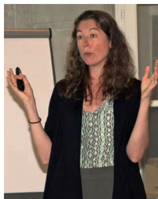
Prof. Sascha Hoogendoorn

and aryl groups be exchanged. The trick to control the position of the equilibrium relies this time on the limited solubility of lithium alkylthiolate that is formed in the reaction as the by-product. The scope of the transformations is stunning, and it includes late-stage generation of a drug library, depolymerization of commercially available polyphenylenesulfide on gram-scale, or access to new phosphorus-based ligands and materials with fluorescent properties. The desire to understand the catalytic cycle led the group to isolate, crystallize, and characterize by X-ray diffraction the catalytic species involved in each step of the catalytic cycle. Each isolated organometallic complex naturally serves as the catalyst itself. Witnessing such interplay of synthetic methodology development with the help of the physical organic chemistry was truly pleasing for everyone in the audience. One of the current challenges that remain to be addressed is the activation of strong bonds, carbon–oxygen bonds in particular.